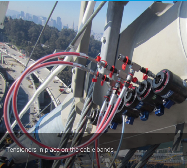
Tensioners in place on the cable bands