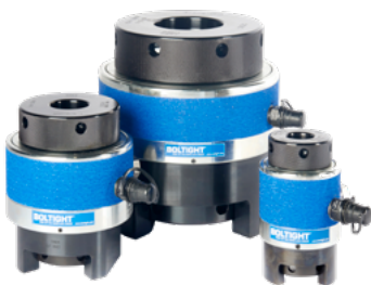
Boltight Standard Spring return tensioning tools

Over 2000 fasteners were tensioned on this application with a high level of accuracy.